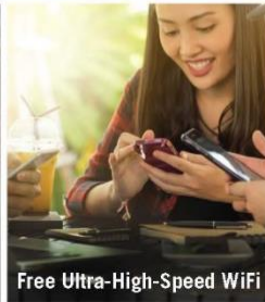
Free Ultra-High-Speed WiFi