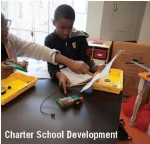
Charter School Development