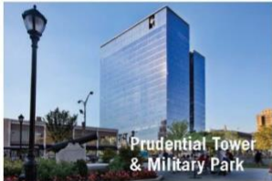
Prudential Tower & Military Park

COMMITTED TO NEWARK FOR MORE THAN 140 YEARS, WE CONTINUE TO SEE THE PROMISE OF PROSPERITY.