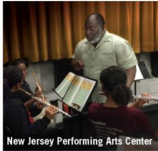
New Jersey Performing Arts Center