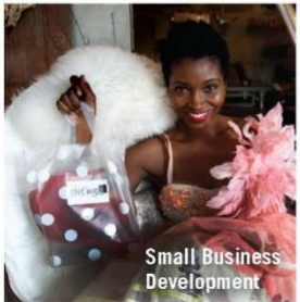
Small Business Development

COMMITTED TO NEWARK FOR MORE THAN 140 YEARS, WE CONTINUE TO SEE THE PROMISE OF PROSPERITY.