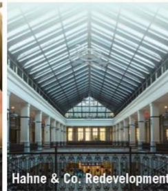
Hahne & Co. Redevelopment