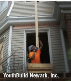
YouthBuild Newark, Inc.