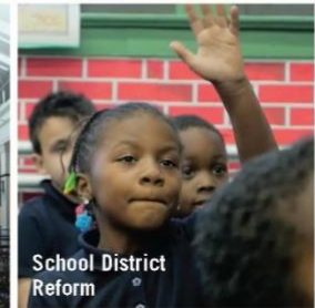
School District Reform